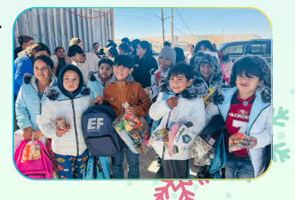
possible to do this. In Cd. Juarez, 250 children's jackets were distributed, thanks to a partnership with Paso Del Norte Foundation.

YLM received 90 crocheted blankets from a prayer group in Oregon, with a request for them to be given to refugee children; a partnership with Rescue Mission of El Paso is making it