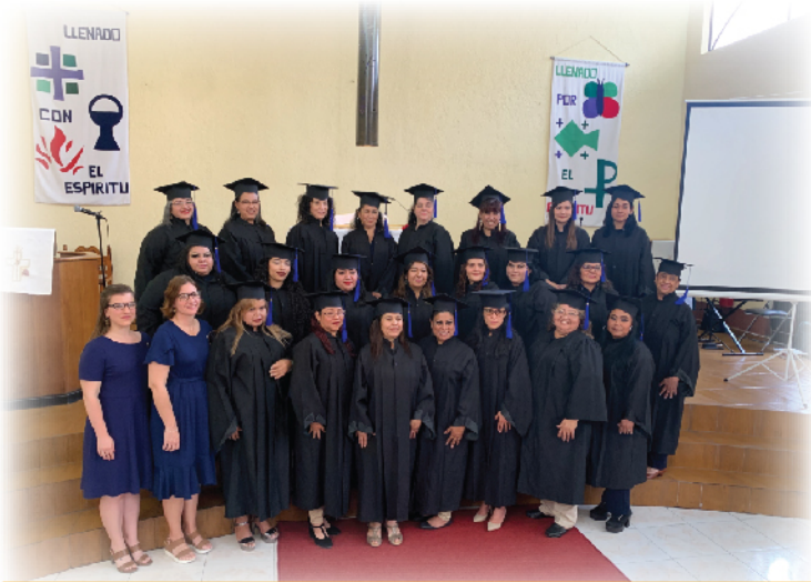
Featured Story, pg. 3

Non-Profit U.S. Postage PAID El Paso, Texas Permit No. 139