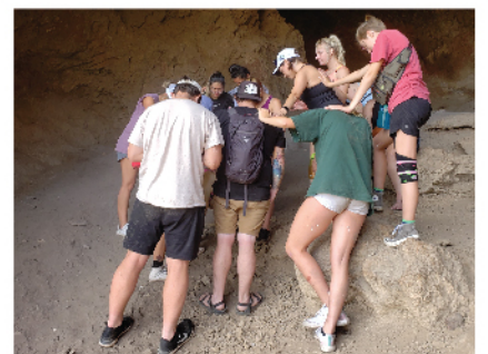
Abiding Savior from Sioux Falls, SD pray over a young woman for the growth of her newly planted church

Thank you for blessing so many in El Paso, Sparks, and Juarez through your acts of love!