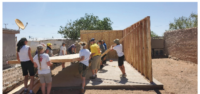
Faith Lutheran from Pierre, SD raised two houses in KM 30