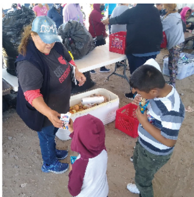
Children and teenagers come to La Santa Biblia or Cristo Rey for food and words of love