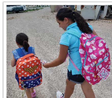
Over 800 children in El Paso and Juarez received new backpacks and new school supplies