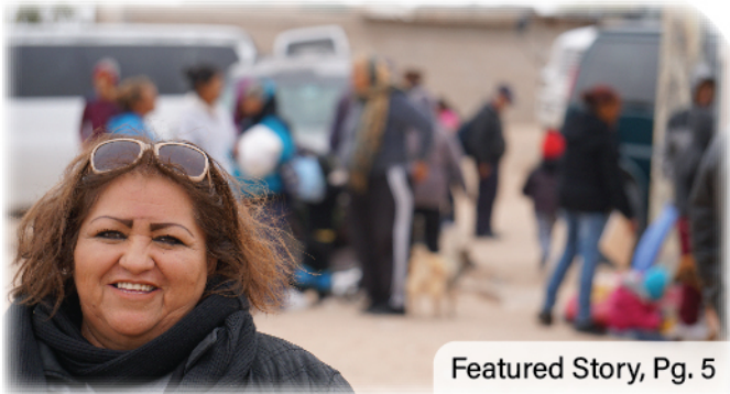
Featured Story, Pg. 5

Non-Profit U.S. Postage PAID El Paso, Texas Permit No. 139