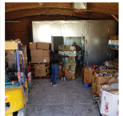
Nine pallets of produce and dairy fit inside the new cooler in the Food Warehouse