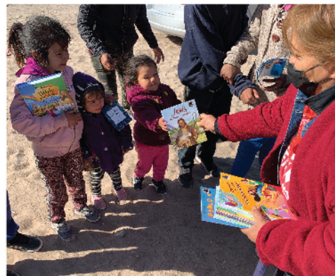
God’s Word and love is shared with children and their parents