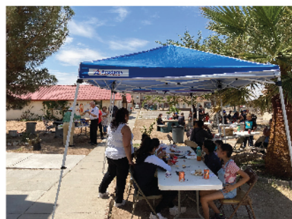
Hope Lutheran from Lubbock, hosted a 3-day VBS at San Pablo