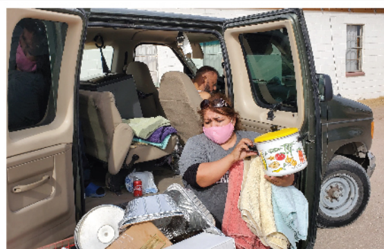
Towels, linens, and other household items are taken across the border for refugees