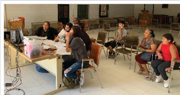
Men, women, and teenagers learn more about God and His Word through virtual courses hosted by the Seminary at the Dominican Republic