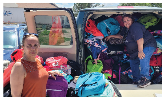
Close to 400 backpacks with school supplies taken to Juarez