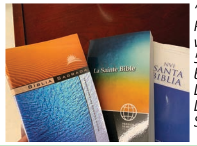
"French and Portuguese Bibles were among the 500 donated to YLM by the LWML and LC-MS through the Lutheran Refugee Services"

"You can listen to YLM's weekly broadcasts live or via our website, iTunes, or Google Play."