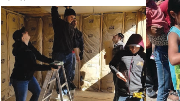
"Servant Event groups' hard work and attention to detail ensure these homes will last for years to come"

Iglesia Luterana de la Santa Biblia in Anapra, Juaréz, was able to host VBS thanks Trinity Lutheran Church from Lincoln, Nebraska. Kids and young teenagers put together crafts as they learned about each Creation Day and the fulfillment of God's promise, enjoying simple and delicious meals every day for lunch. While at La Santa Biblia, Trinity Lutheran not only lead VBS, they also built a home for a family of four and distributed backpacks and school supplies to all school aged children. This Nebraska church has been coming to YLM since 2001.