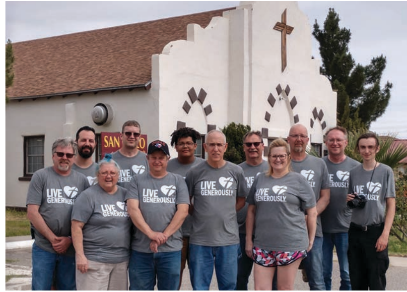
"Trinity Lutheran Church spent a week at YLM leading the first VBS at La Santa Biblia"