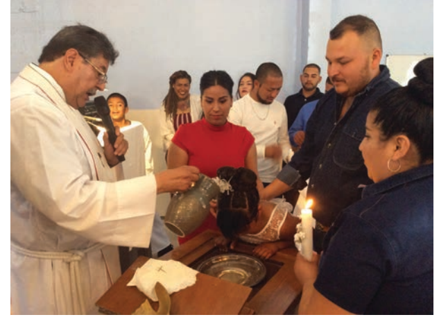
"Seven children were baptized into God's family on Easter Sunday"