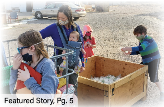
Featured Story, Pg. 5

Non-Profit U.S. Postage PAID El Paso, Texas Permit No. 139