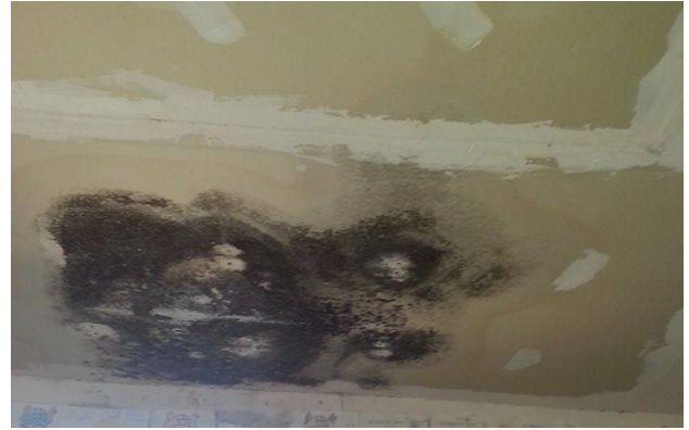
Above: The roof has caused interior damage as well Below: The existing roof to be replaced

Project costs are $1820 This includes building materials, tools, and miscellaneous items needed for the projects. The cost of these materials should be divided among the entire group.